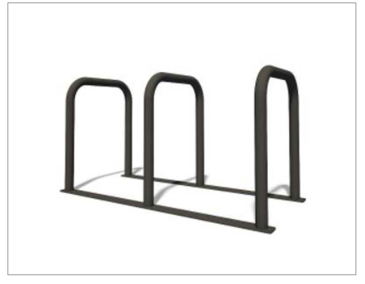
LP501 DIMENSIONS | 1650 x 800 x 780 mm