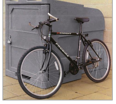
BYKEBIN SAPPHIRE (Above) BYKEBIN PALE GRANITE (Below)