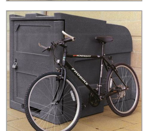
BYKEBIN EMERALD (Above) Bykebin dark millstone (Below)