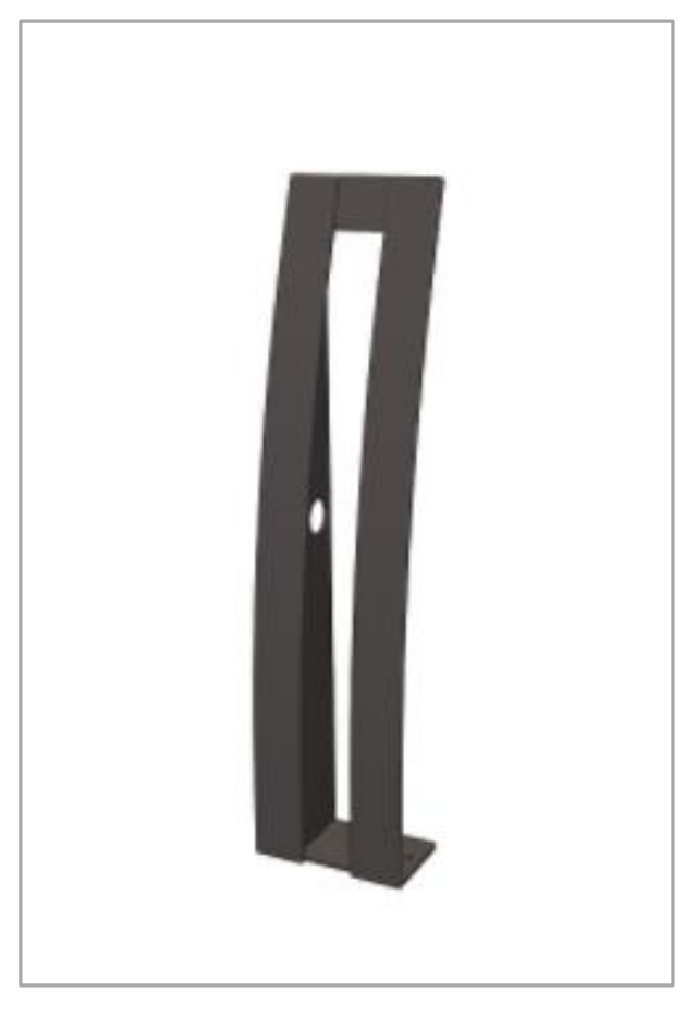
LP302 Dimensions | 240x161x1000mm