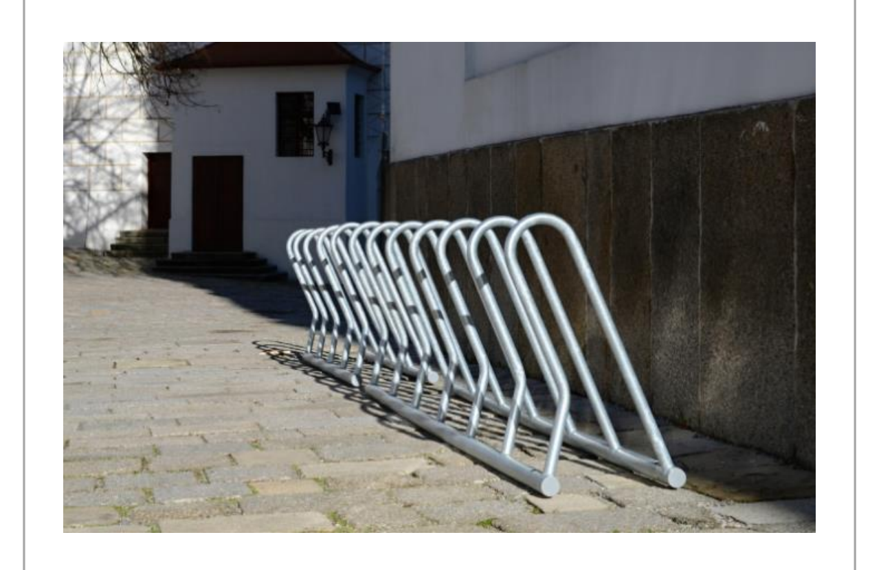
WELDI DIMENSIONS | 2000 x 520 x 860 mm