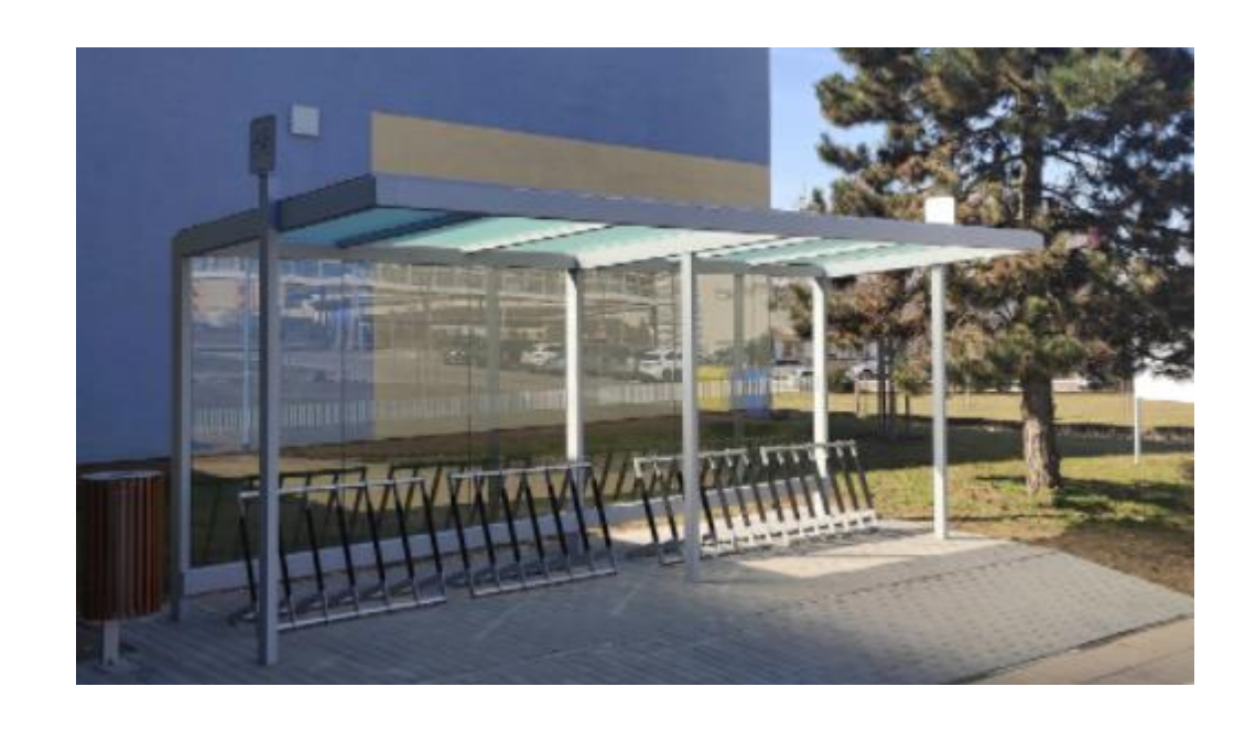
FRAMEO CYKLO DIMENSIONS | 3300 x 2404 x 2595 mm